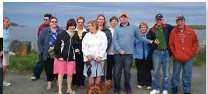
The group at Ferryland Lighthouse

Presentations were made by KISS (Kids in Safe Seats), CAPSC Motorcycle Safety, CAPSC Bicycle Safety, HOGS (Harley Owners Group) who wore Pink Bows on their motorcycles in memory of