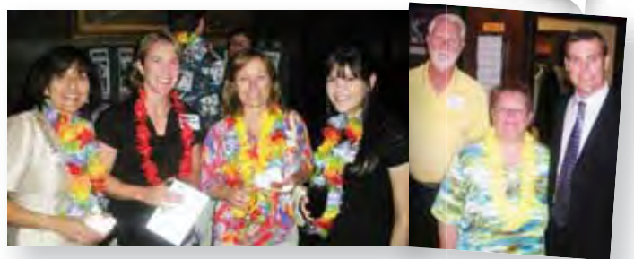
Waterloo-Wellington County HOO guests had a great evening in support of those afflicted with a disability from an acquired brain injury