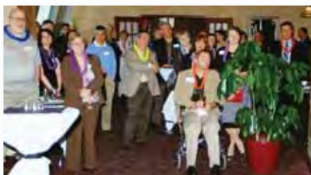
Who's who at the HOO!