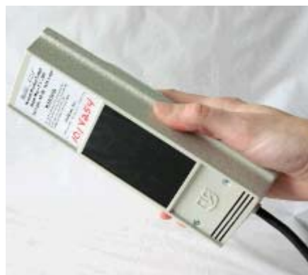
UV-C Radiation Therapy Treatment Device